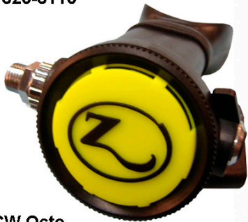
CW Octo 320-5010