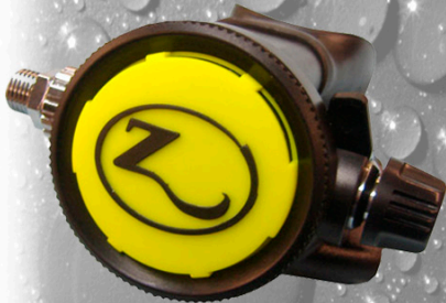
ZX Octo 320-1110