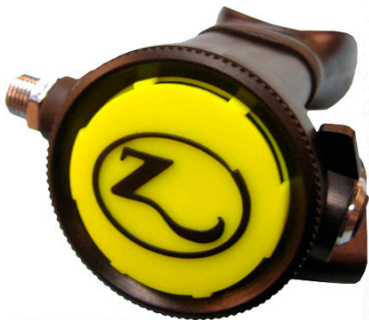
Envoy Octo 320-3110